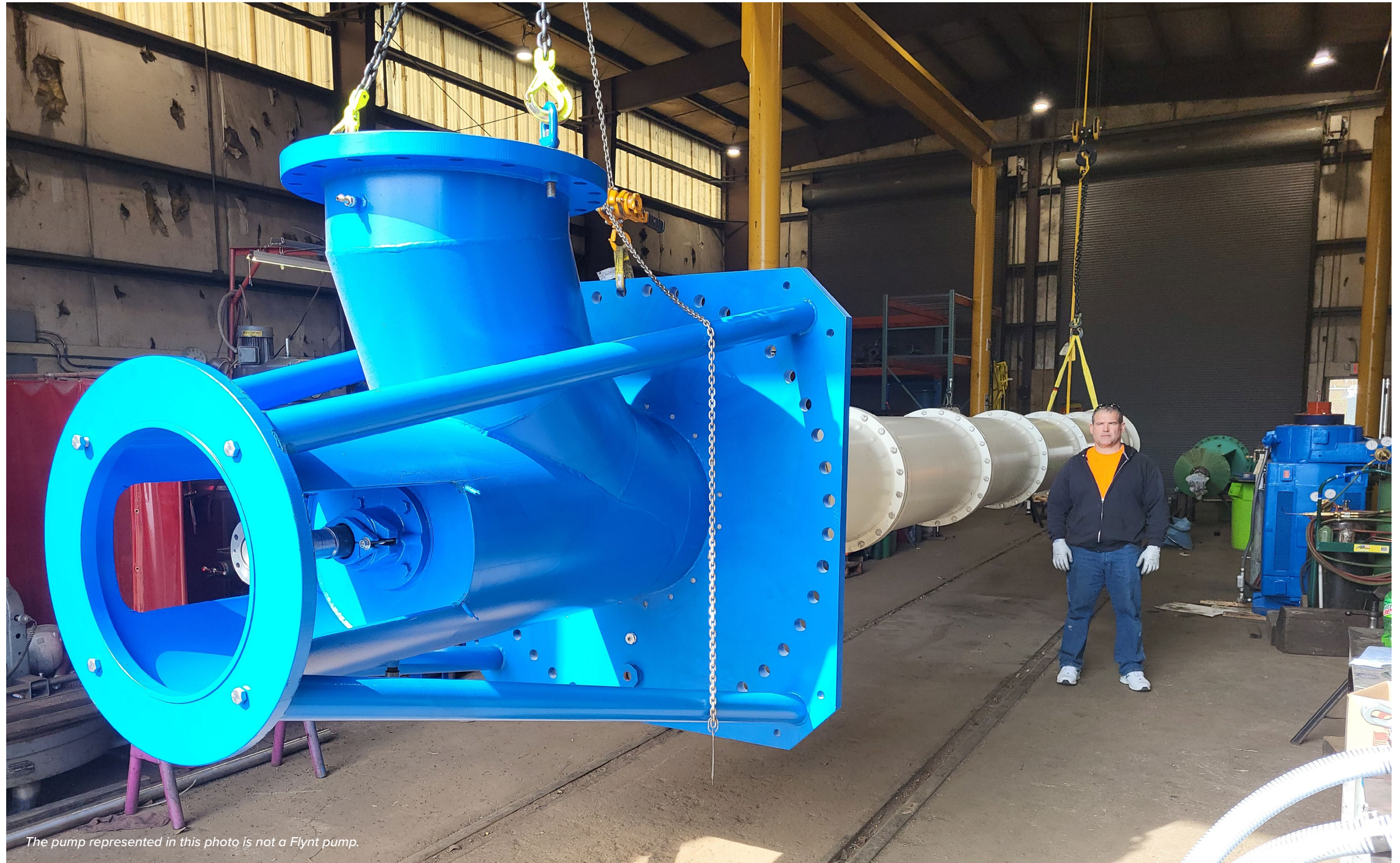
The pump represented in this photo is not a Flynt pump.