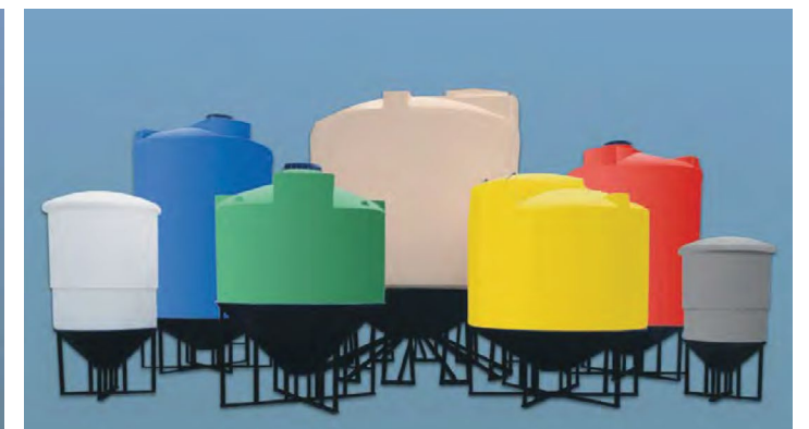
Conical bottom storage tanks are available in seamless molded one piece units from either virgin high density crosslink or FDA-compliant linear polyethylene.