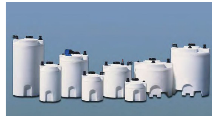
Small double wall tank systems consists of a primary inner tank and secondary containment, with a capacity of 120% of the inner tank, exceeding EPA standards and complies with 40 CFR-264.193.